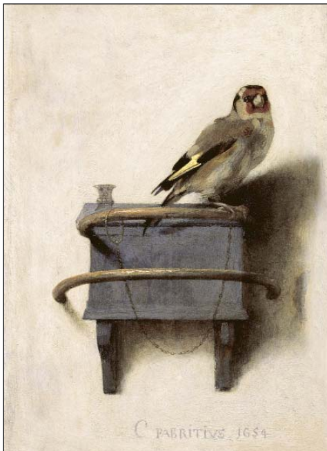
Carel Fabritius (1622–1654), "The Goldfinch," 1654, oil on panel, Royal Picture Gallery Mauritshuis, The Hague.

NEW YORK CITY — "Vermeer, Rembrandt and Hals, Masterpieces of Dutch Painting from the Mauritshuis" will open at the Frick Collection on October 22. This exhibition will be a ticketed event at The Frick, and timed tickets are now on sale.