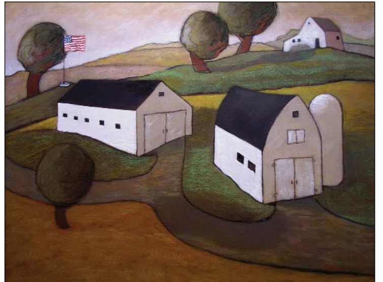
Robert Ferrucci, "American Barn," acrylic, 30 by 40 inches.

In another painting, titled "Skyler River Bend," the sun appears like a small fireball on the horizon, dipping into a pink- and blue-tinged sky. Its reflection skitters across the surface of a lively river, which winds past three, small, white houses and a sparse landscape of hills and trees.